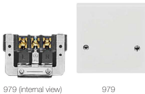
979 (internal view)